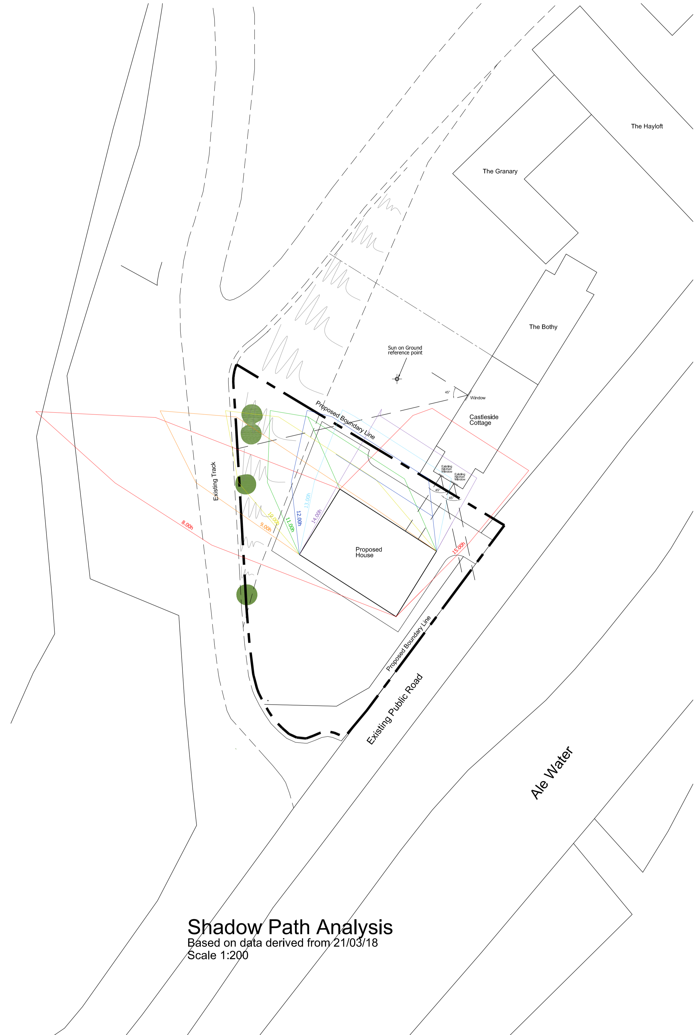
Shadow Path Analysis Based on data derived from 21/03/18 Scale 1:200